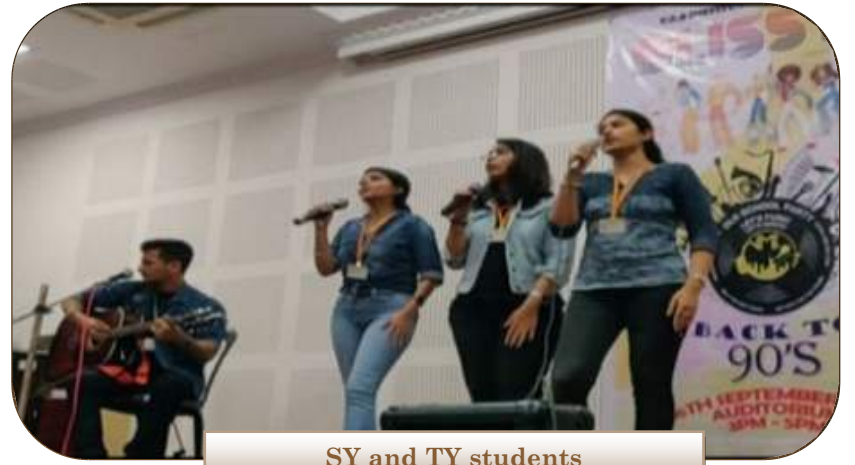
SY and TY students