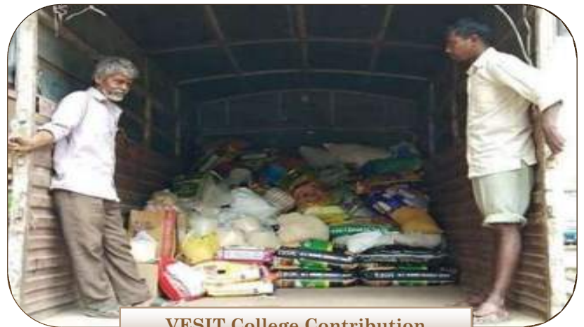
VESIT College Contribution