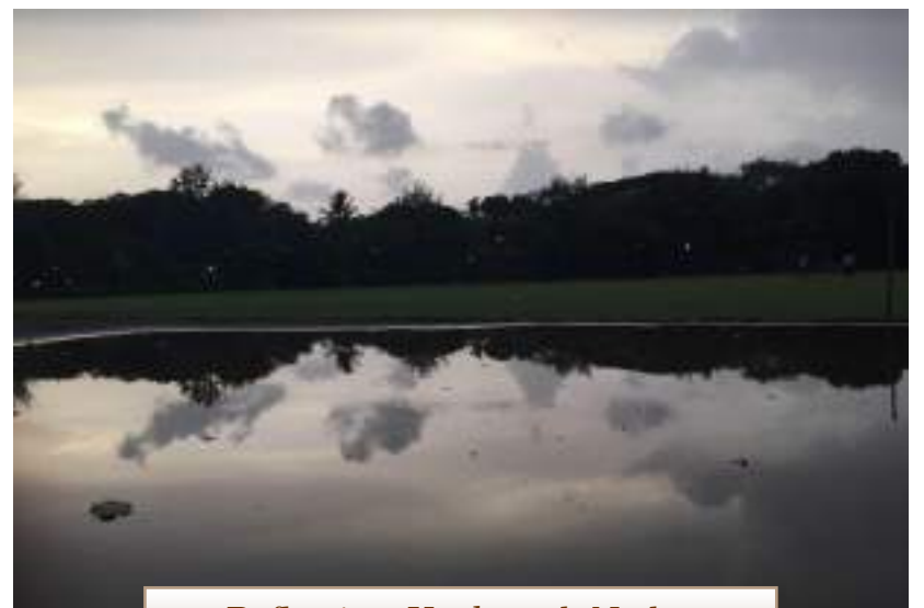
Reflection, Venkatesh Nadar