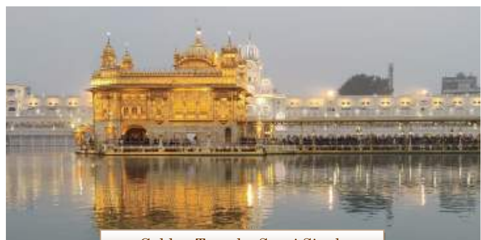
Golden Temple, Suraj Singh