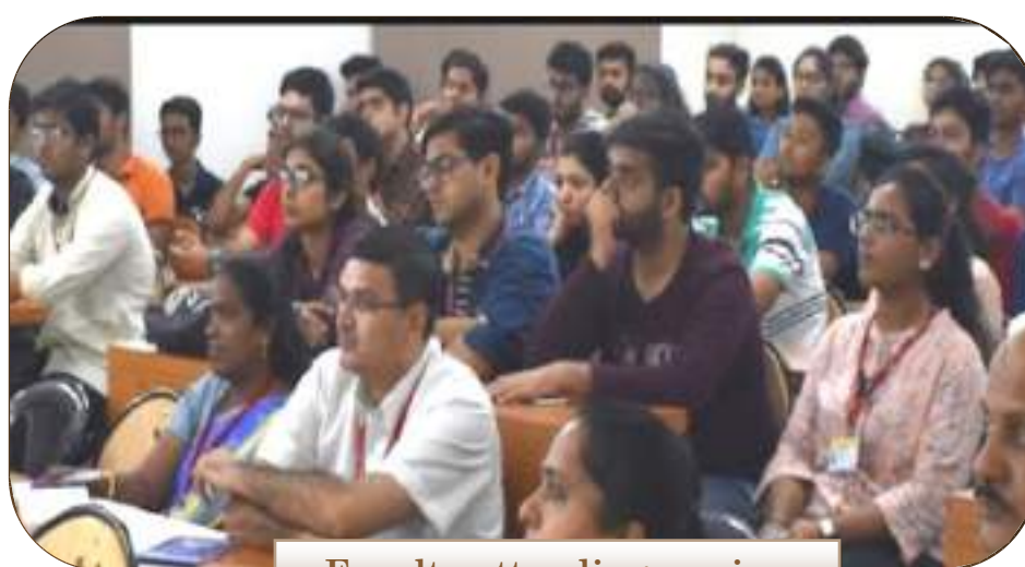
Faculty attending session