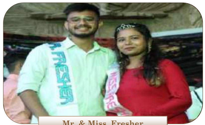
Mr. & Miss. Fresher