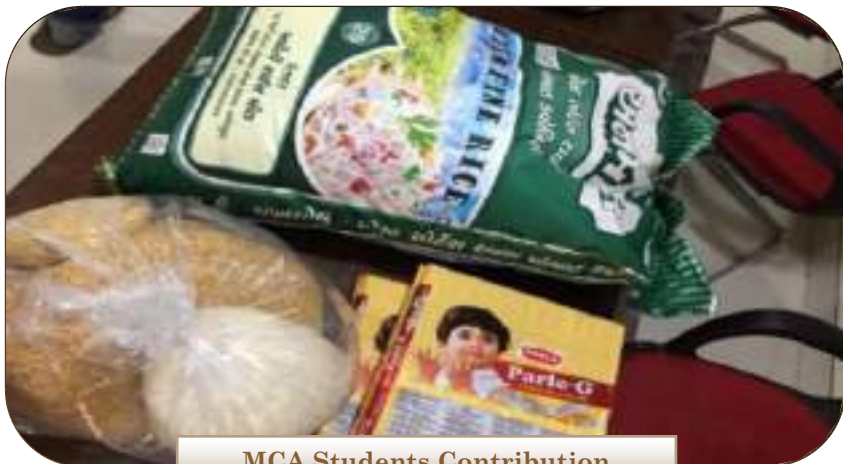
MCA Students Contribution

Kolhapur was flooded for several days and the situation was getting worse day by day. Hotel Mank Sangh helped the Sort council by preparing food for the rescued people. Students contributed to help by donating money, groceries & urgency items like lentils, grains, medical aid, sugar, candles, matchbox etc. Students of SYMCA contributed for this noble cause