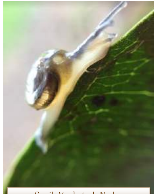
Snail, Venkatesh Nadar